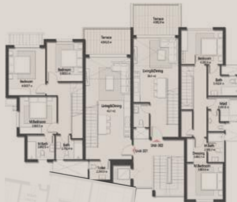
Fourth Floor Plan